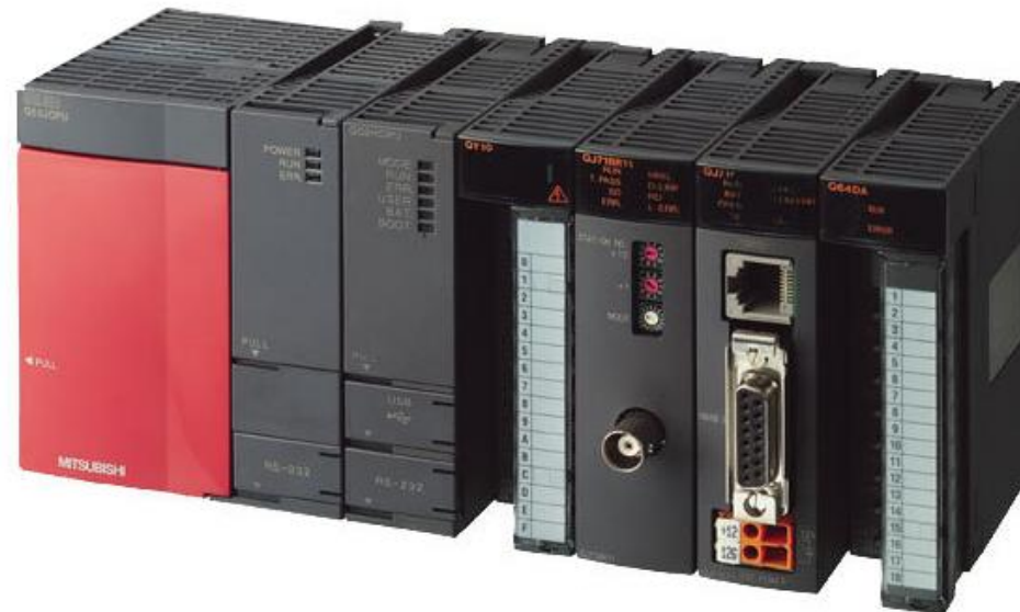
Mitsubishi-Q series PLC